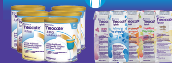
Neocate® Junior Unflavored, Vanilla, Strawberry, Chocolate, Tropical